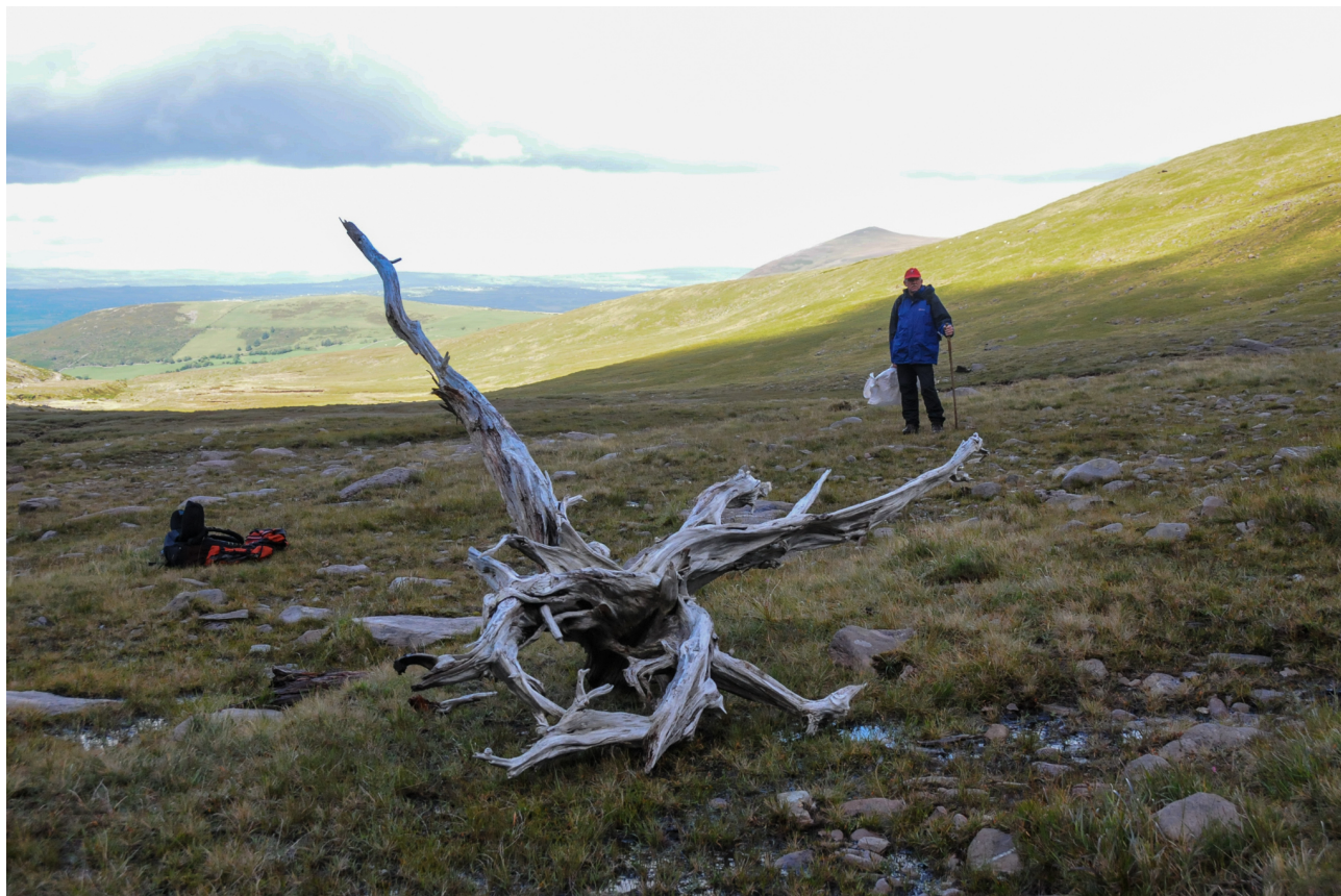
Fig. 5. Sampling pine stumps in the Hag's Glen, Killarney, Co. Kerry. Peat cutting has exposed many pine stumps beneath shallow covering of blanket bog. This particular stump appears to have been blown by the wind.

including upland blanket bog (Fig. 5). Results of radiocarbon-dating of bog-pines from uplands in Connemara, Kerry (mainly the Killarney area), and also west Cork and Wicklow, are presented. While there is a considerable spread of dates, many of these timbers are shown to be about 5000 years old. The increasing scarcity of dates thereafter is also noteworthy. In fact, dates younger than ca. 3500 years ago are seldom recorded, reflecting no doubt the scarcity of pine and especially the greatly increased wetness of bog surfaces generally that effectively ruled out these as potential habitats for pine.