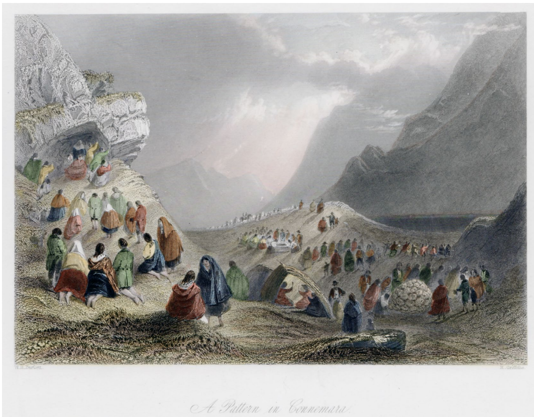
Fig. 3. Hand-coloured, engraved print depicting a pattern in the early nineteenth century at Mám Éan (view from the southern approach; Bartlett and Griffiths, 1835). Note the complete lack of woody vegetation then as now.