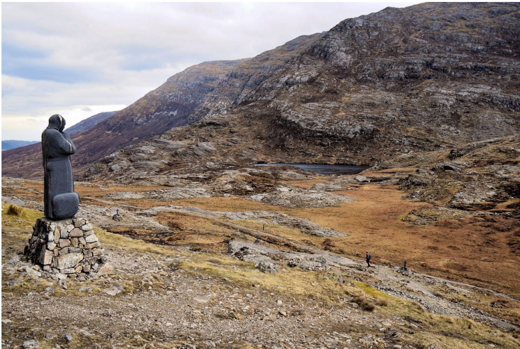
Fig. 2. View of the treeless landscape at the pass at Mám Éan showing the statue to St. Patrick and the corrie lake (max. depth: ~5 m). Photo: 15/03/2020, M. O'Connell.

by C.C. Huang 2 , have been revisited, all available data have been re-evaluated and a new synthesis made.