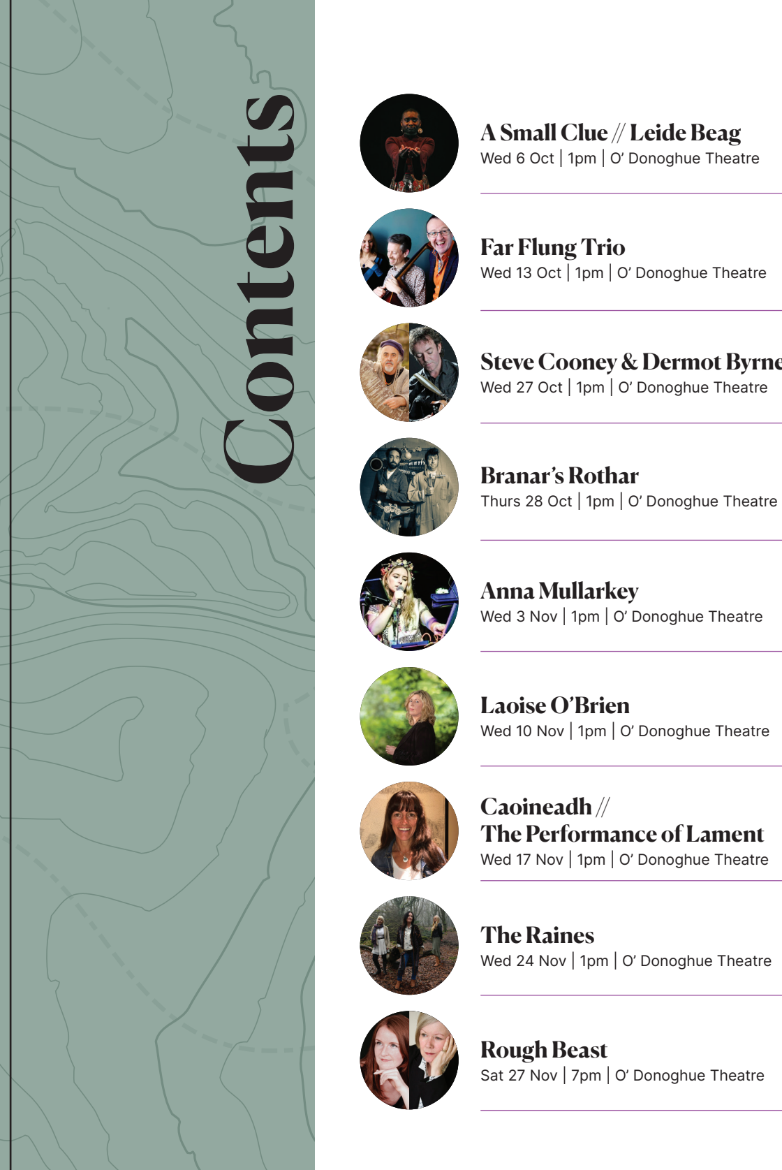
A Small Clue // Leide Beag Wed 6 Oct | 1pm | O' Donoghue Theatre