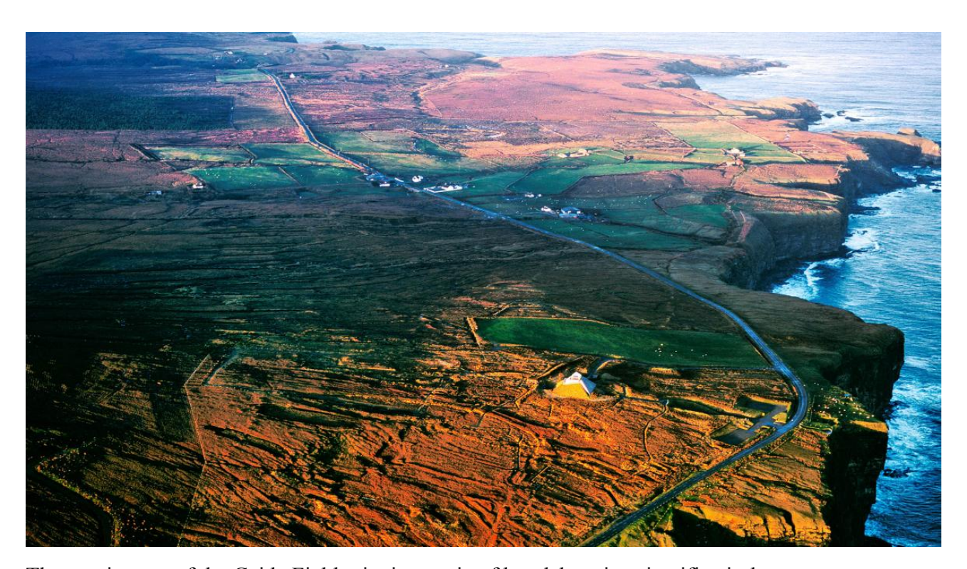
The precise age of the Ceide Fields site is a topic of hot debate in scientific circles

Sunday February 16 2020, 12.01am GMT, The Sunday Times