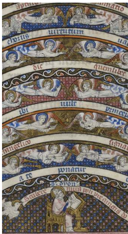
The celestial hierarchy