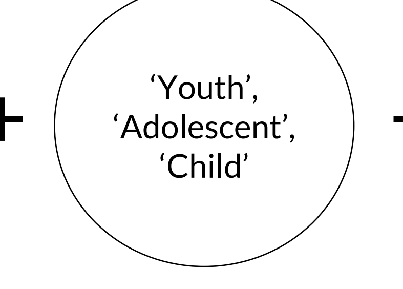
Keywords: age group

Keywords: sexual orientation, biological sex and gender identity