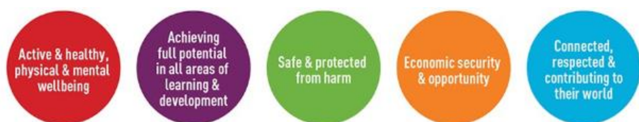
Figure 1: The five Outcomes under BOBF National Youth Policy Framework.