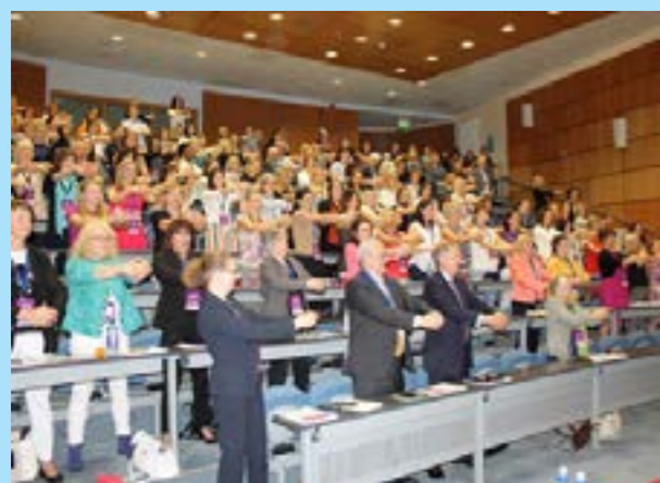
Delegates doing morning stretches prior to the plenary session

Details of our 2017 Conference are available at www.hprcconference.ie