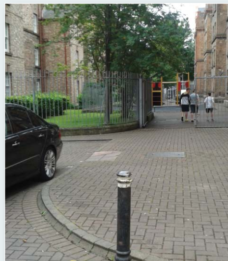
Figure 2. Managed area within a housing complex. Iveagh Trust Flats. Kevin Street, Dublin 8

The Iveagh Trust flat complex has been deemed an example of architectural design that promotes and accommodates community engagement and interaction (McDonald, 2000). The Iveagh Trust is a social housing complex that is over one hundred years old, but there are many other social housing and gated community complexes that can be found in the Liberties.