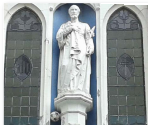
Figure 5. Sophia Housing, Cork Street, Dublin 8

The group discussion of these visual materials resulted in a greater appreciation for religious diversity and migration in the Liberties. For example, we noted the dominant presence of Catholic Symbols (see figure 4) and buildings in the area while also appreciating changes in the relationship between the Catholic Church and the community with several buildings such as Sophia Housing in Cork Street (see figure 5) now serving more secular functions.