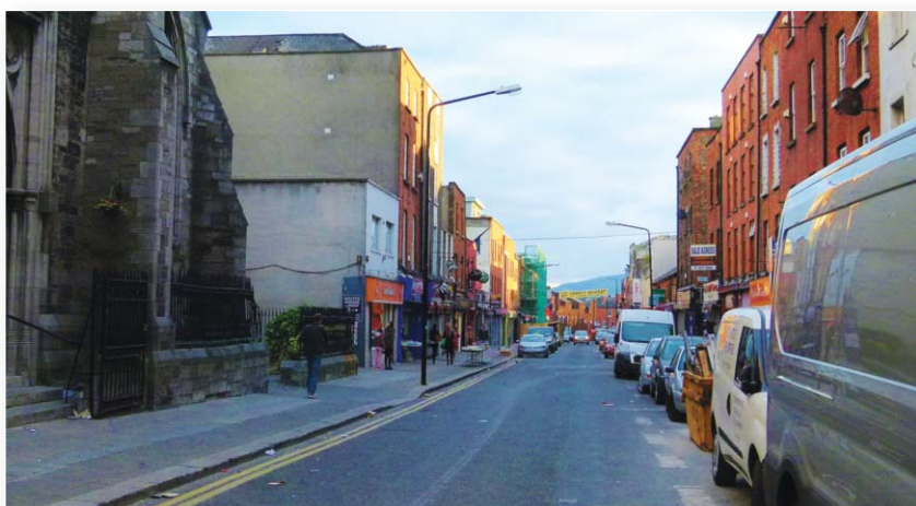
Figure 3. Commercial area in the Liberties. Meath Street, Dublin 8

Liberties community life is strongly linked to its key commercial areas which include Thomas Street, Francis Street and Meath Street. In our exploration of public spaces, we have found that these areas continue to be an important component of community life in the Liberties. However, there are indications from our focus group discussion that these commercial spaces are becoming less significant for the younger generations and furthermore they are also problematic for people with physical disabilities such as wheelchair users.