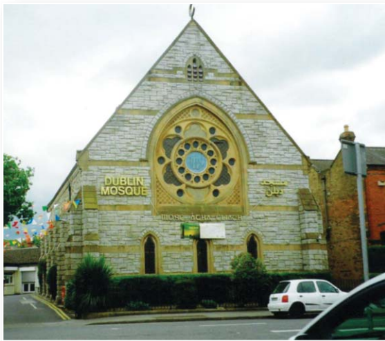
Figure 6. Dublin Mosque, South Circular Road, Dublin 8

These themes highlight for us evolving changes regarding both the emergence of a greater secular community, as may be the case for growing numbers of Irish people in the Liberties, and also the emergence of a new community in the area which we associate strongly with religion.