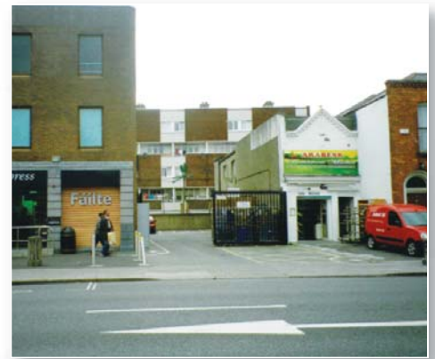
Figure 7 at the periphery of the Liberties, South Circular Road, Dublin.

Supermarket, are a hub in terms of being a central place of activity which caters for most groups in the community. We see potential in these spaces in terms of access and communication with the wider community.