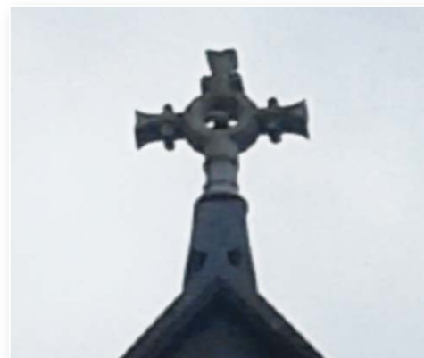
Figure 4. Sophia Housing, Cork Street, Dublin 8

We started this process by capturing through photography some of the visual elements and symbols that we believe are associated with migration, change and existing communities in the Liberties. Religious icons and places of religious worship were felt to be one of the main visual signifiers of migration. Catholic, Jewish, Protestant and Muslim communities are strongly represented in the area.