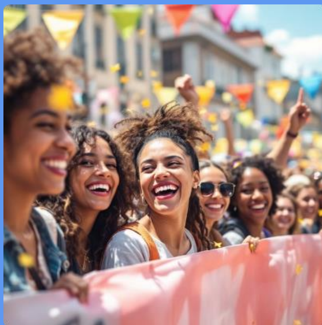
Vibrant Student Life

Explore the breathtaking Douro Valley just a short trip from the City