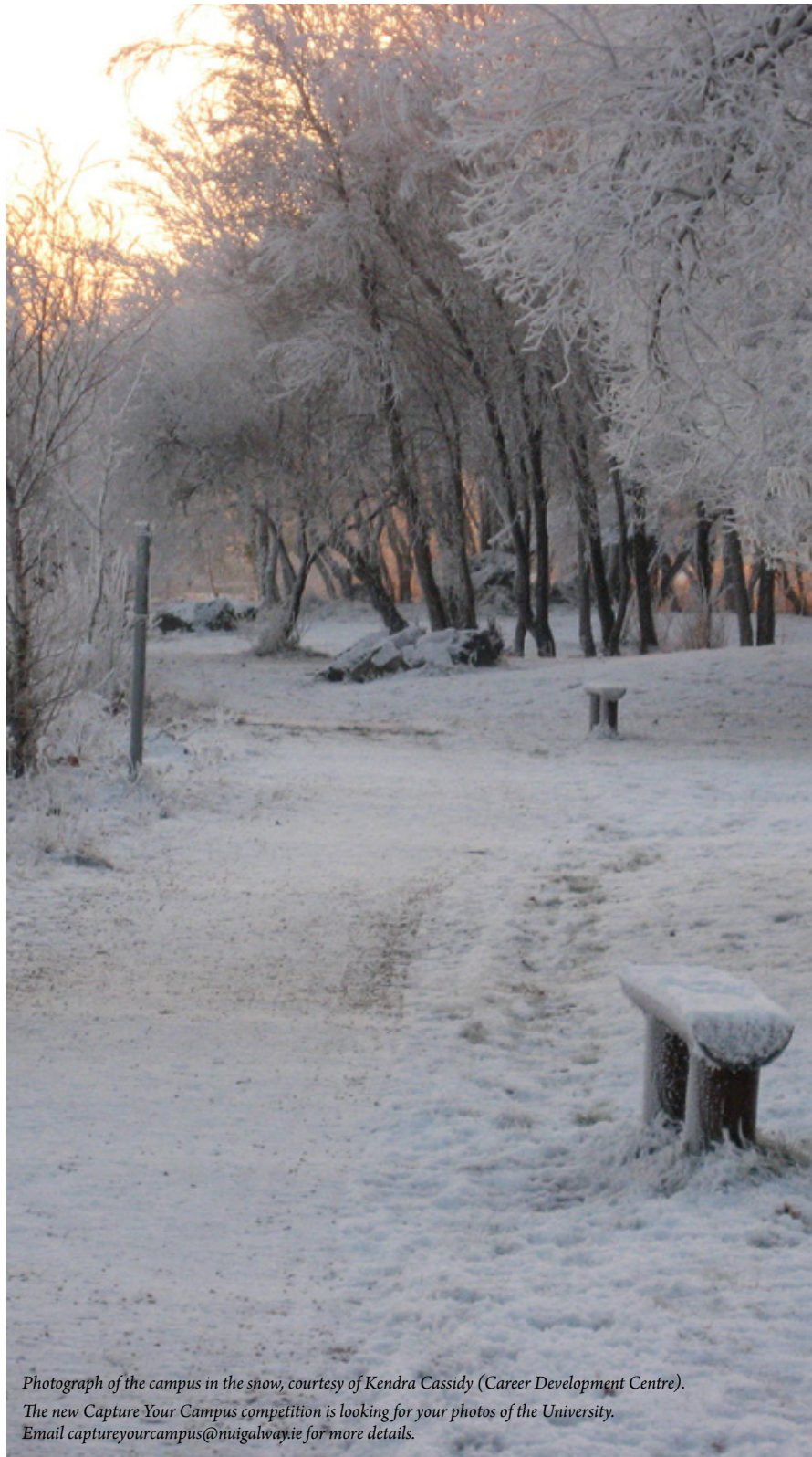
Photograph of the campus in the snow, The new Capture Your Campus competition is looking for your photos of the University. Email captureyourcampus@nuigalway.ie for more details.

Everybody has their own way of marking the holiday season. Here, some of our staff share their special holiday traditions, from Italy to the Aran Islands.