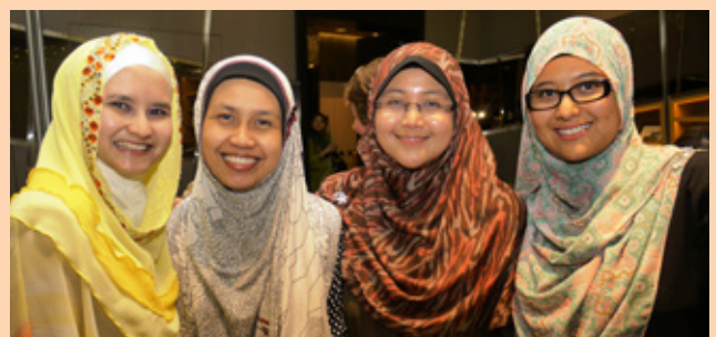
Some of our Malaysian alumni enjoying the recent reunion in Kuala Lumpur organised by the Galway University Foundation. The University has strong links with Malaysia, particularly in Medicine, which attracts many students from the country each year.