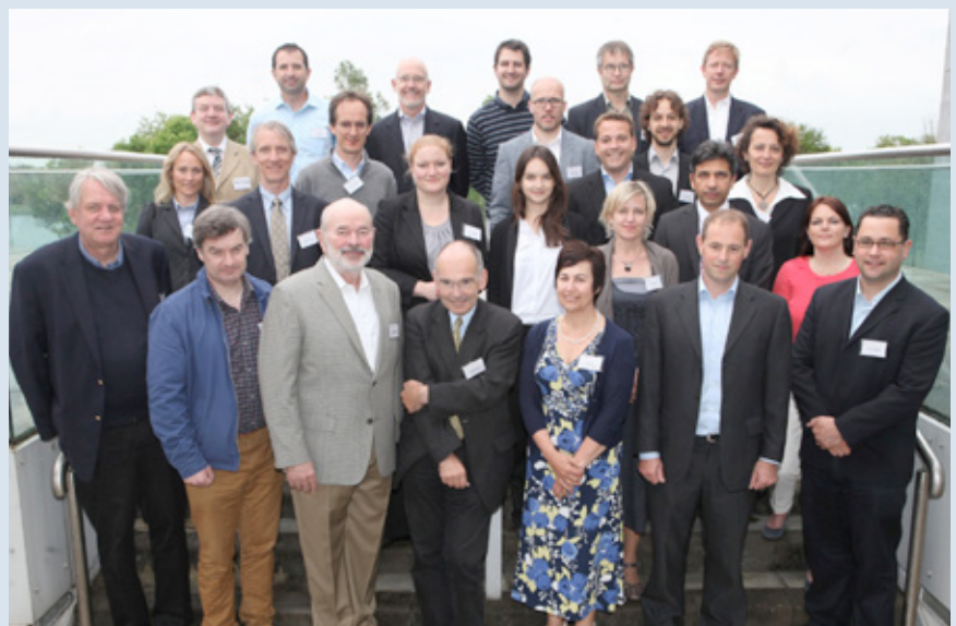
Pictured at the BME-IDEA Europe meeting in NUI Galway were 30 delegates from 15 different BioInnovate/ Biodesign style university programmes from across Europe and the US.

The University recently hosted the first European meeting of the Biomedical Engineering Innovation Design and Entrepreneurship Alliance, in conjunction with US-based Stanford Biodesign. Galway was chosen to host the international workshop because of its strong medical device cluster and the University's close links with researchers in Stanford. The event was an opportunity for delegates from 15 biomedical university programmes from across Europe and the US to share their best practices in innovation, design, technology transfer and entrepreneurship.