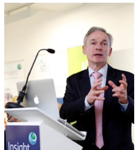
Insight was officially launched by Minister for Jobs, Enterprise and Innovation, Richard Bruton TD, on Thursday, 12 December.

Enterprise Research Institute, NUI Galway has already developed expertise in this field, and we will play a leading part in the new centre. Collaborating with counterparts in DCU, UCC and UCD, our researchers will focus on new ways of capturing and understanding data from the world around us, making better decisions for people, communities and industry, and creating a more informed society in a healthier, more productive world.