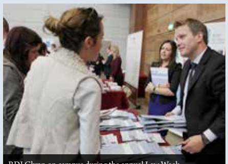
RDJ Glynn on campus during the annual Law Week