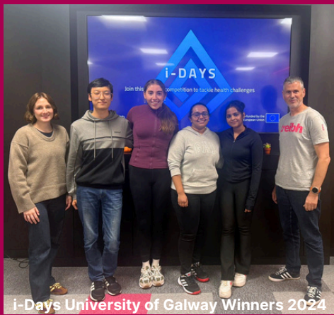
i-Days University of Galway Winners 2024

Collaborating with an EU consortium that included members of the ENLIGHT European University Alliance on the i2i project, we focus on developing capacity for complex problem-solving, connecting our students to Europe's broader innovation ecosystem. These initiatives foster cultural exchange, enhance professional networks, and expand future career opportunities, supporting the University's vision to create global impact through distinctive research and transformative student experiences.