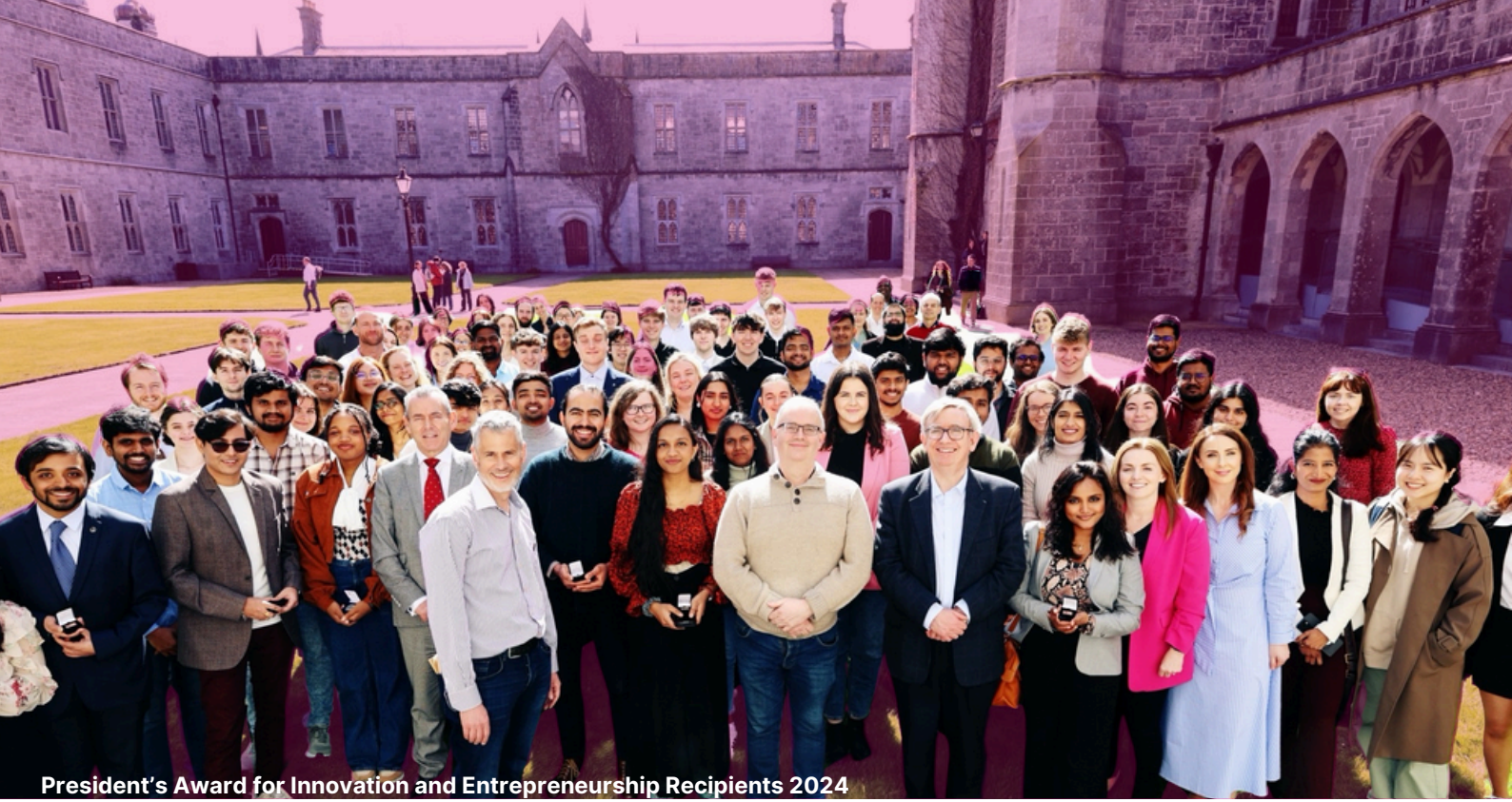
President's Award for Innovation and Entrepreneurship Recipients 2024