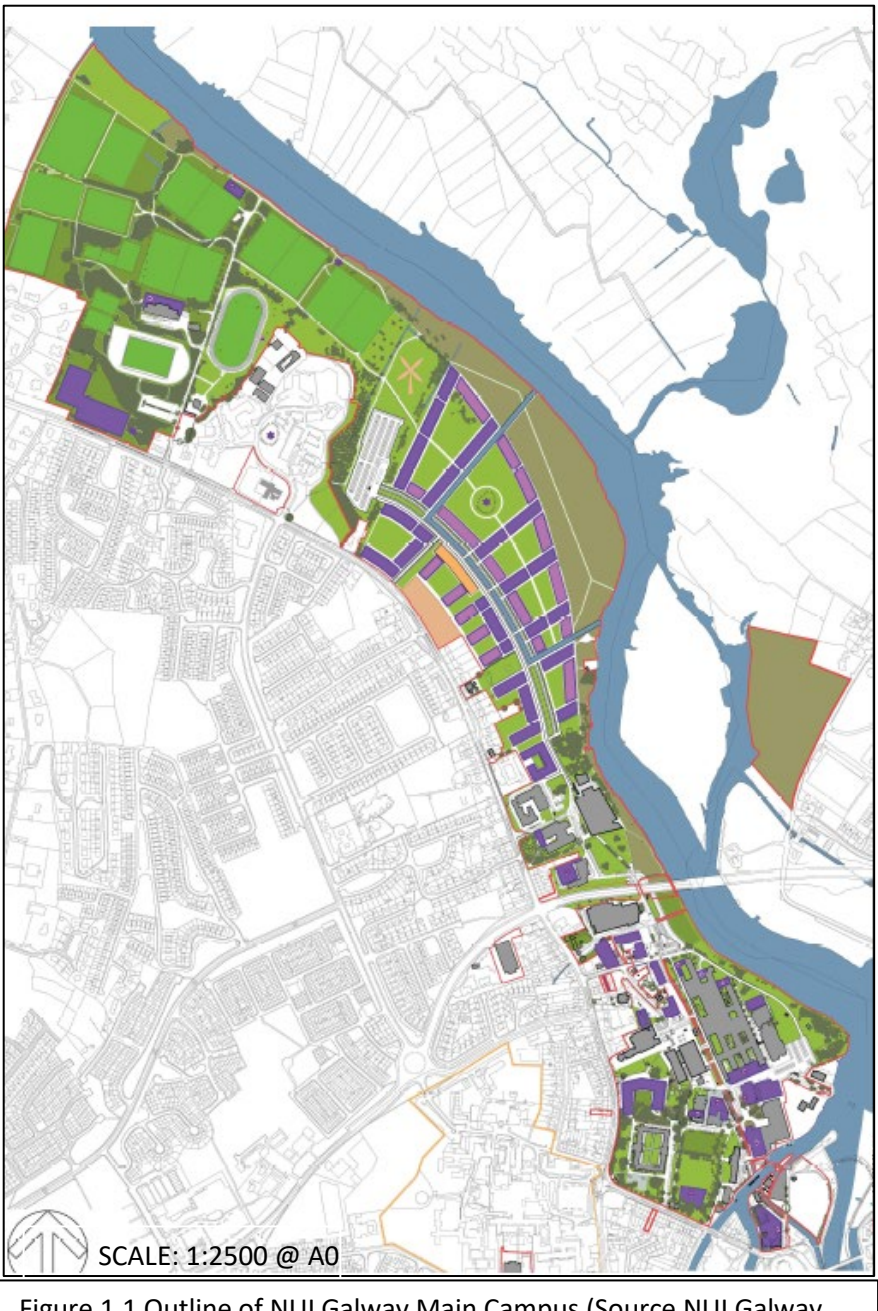
Figure 1.1 Outline of NUI Galway Main Campus (Source NUI Galway Masterplan 2015 Reddy Architecture + Urbanism 2017)

The main campus covers an area of 105.5 ha, with the Carron, Carna and Finavarra Research Stations collectively adding another 4 ha. Including Acadamh premises at Carraroe and Gweedore, Mace Head, Shannon College, Medical Academies in Castlebar, Sligo and Letterkenny, NUI Galway is responsible for 1,330,330 m<sup>2</sup>.