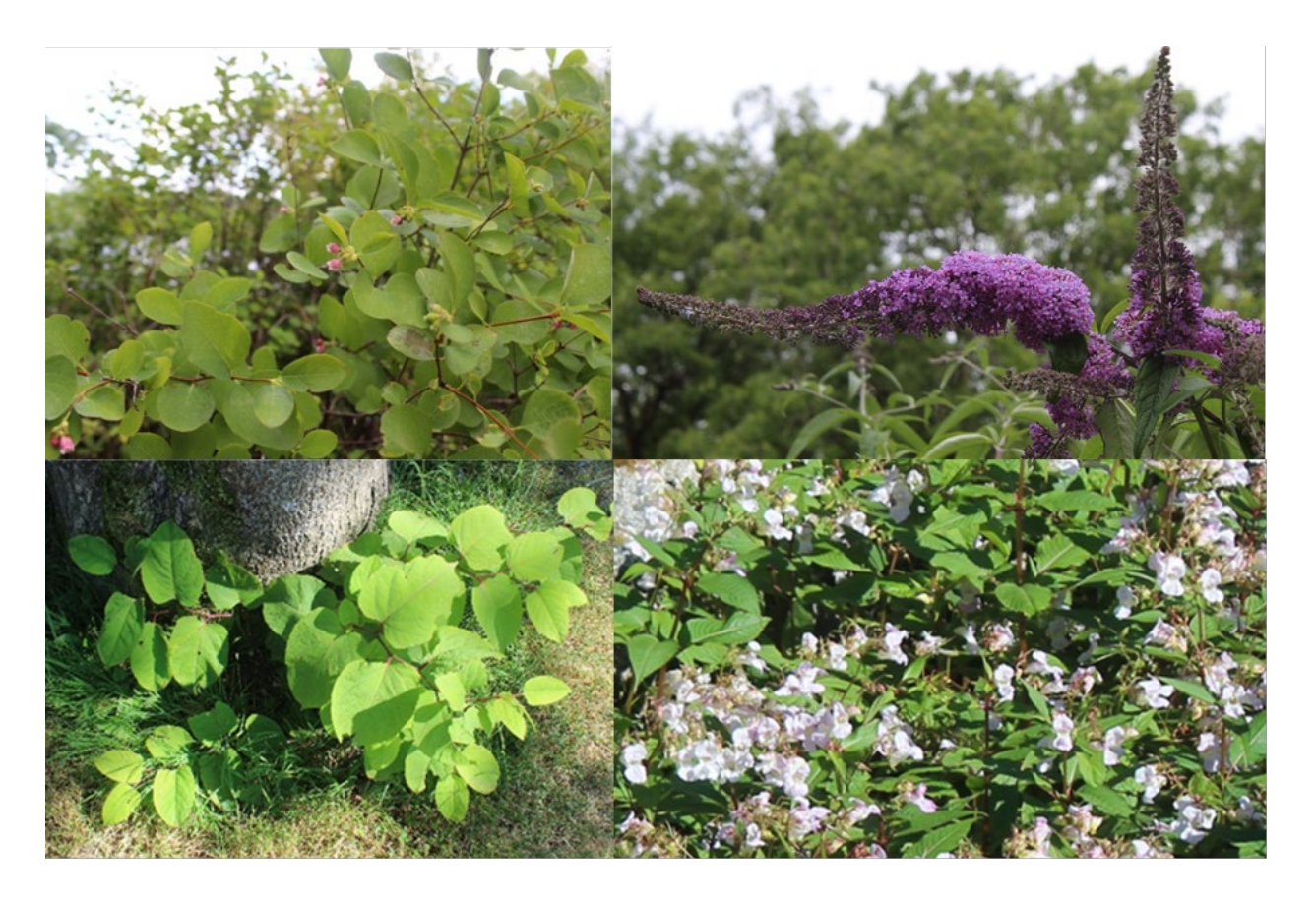
Figure 5.1 Invasive species on campus (from top, left to right): snowberry, buddleja, Japanese knotweed, Himalayan balsam

Species are classed as invasive when they are introduced to an environment outside of their native range, where they adversely affect native biodiversity, human infrastructure, economy or health (IUCN, 2000). As these invasive alien species are less susceptible to local predators and diseases, many are known to outcompete native plants and animals (Figure 5.1), typically forming monocultures (Figure 5.2). It is therefore important to remove these organisms before they spread and become a recurring problem (Table 5.1).