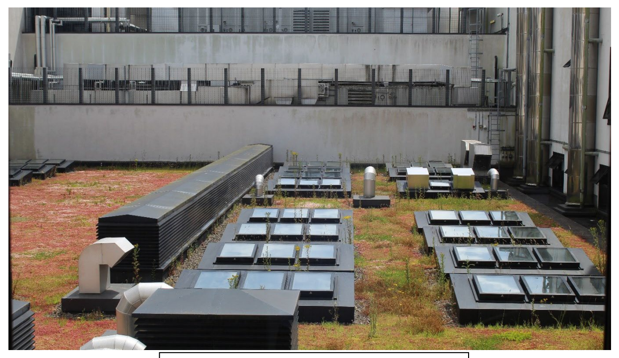
Figure 4.5 The Engineering Building's green roof

Green roofs (Figures 4.5, 4.6) and living walls (Figure 4.7) are components of green infrastructure. They form part of a multifunctional network throughout the campus including pollinator verges, meadows, herb beds, hedgerows and woodland. Green roofs provide some habitat for wildlife, absorb carbon dioxide from the atmosphere, decrease noise pollution and reduce heating costs (Lõhmus, and Balbus, 2015; Santamouris et al., 2007). More diverse vegetation on green roofs lead to a more complex community structure (Madre et al., 2013); with green roofs capable of supporting diverse assemblages of birds, insects and spiders- (Brennisen, 2003; Coffman and Waite, 2011). Living walls are similar to green roofs, covering façades of buildings while providing similar benefits to wildlife (Ottelé et al., 2010).