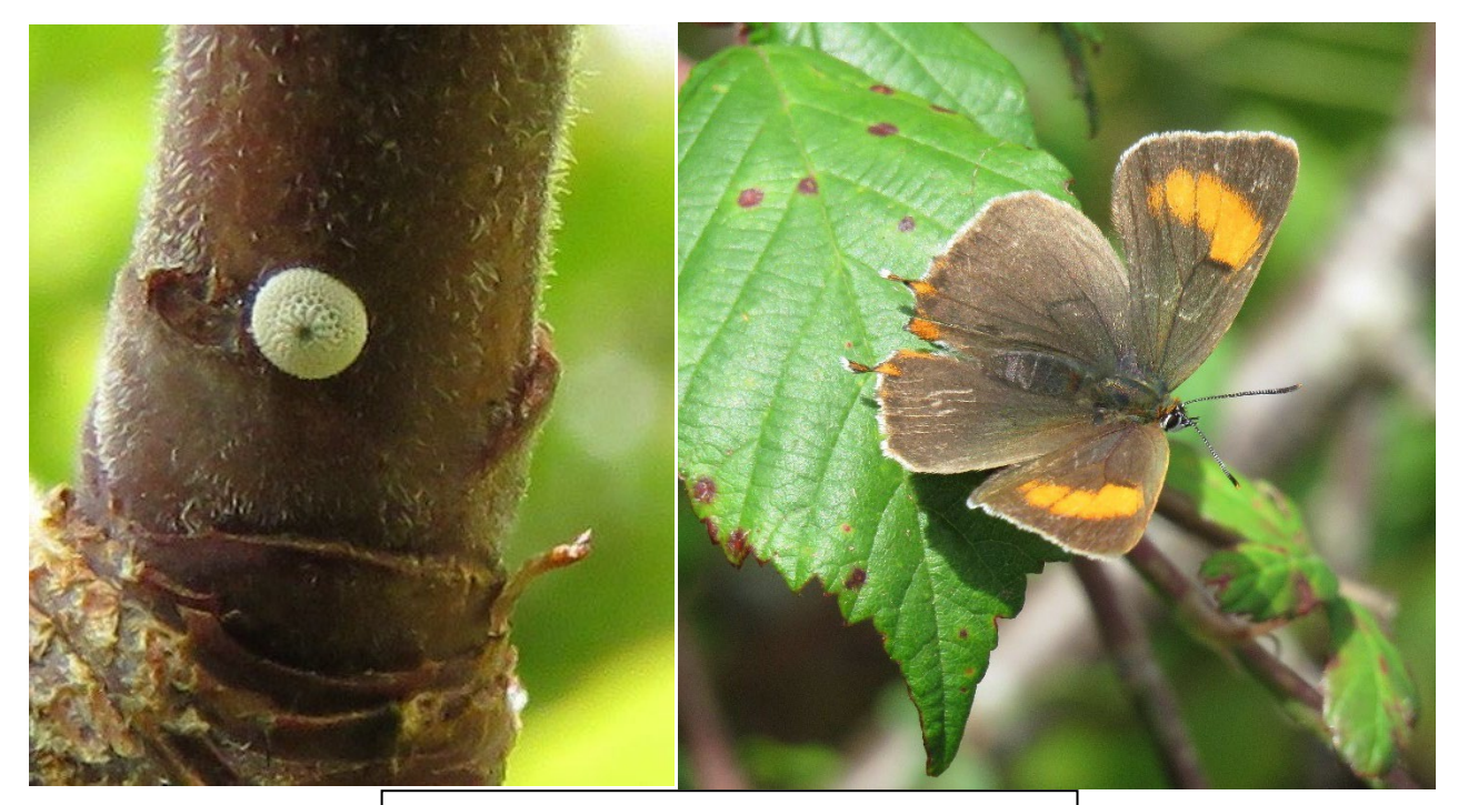
Left: Fig. 4.1 Brown hairstreak egg on blackthorn. Right: Fig. 4.2 Brown hairstreak adult female

In January 2019, Caitríona Carlin, Applied Ecology Unit discovered brown hairstreak butterfly ( Thecla betulae ) eggs on young blackthorn on campus (Figure 4.1). As this butterfly (Figure 4.2) has a restricted range in Ireland, only recorded in Clare, parts of Galway, north Tipperary (Harding, 2008) and Mayo (Gammell and Carlin in press), habitat enhancement measures for this species are to be undertaken to mitigate development impacts in the vicinity of one of the sites in question (Figure 4.3). MKO Ltd, a local environmental consultancy involved in surveying the area prior to its development, developed the actions seen in Table 4.1, in collaboration with NUI Galway.