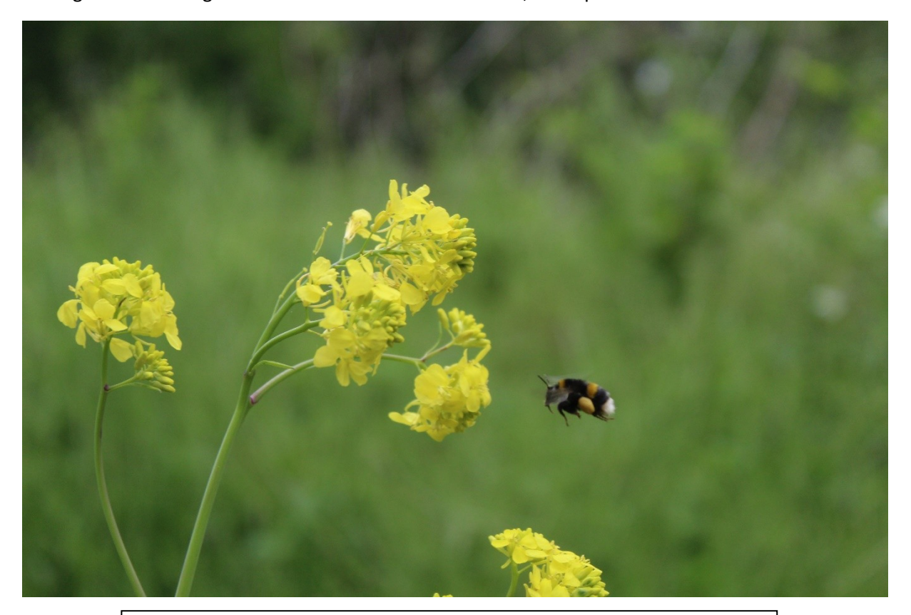
Figure 2.2 A white-tailed bumblebee ( Bombus lucorum agg.) and charlock

Pollinators such as bumblebees, hoverflies, butterflies, moths and other insects help fertilise crops, fruits, and flowers (Figure 2.2). Due to declines in their numbers, an <u>All-Ireland Pollinator Plan</u> is working to increase pollinator numbers by bringing about a landscape where they can flourish. NUI Galway signed up to the All-Ireland Pollinator Plan in 2018 and has committed to providing sustainable habitats for pollinators on campus, by following the guidelines from the All-Ireland Pollinator Plan booklet. Student projects will be dedicated to monitoring and evaluating the effectiveness of these measures, for implementation in to the next BAP.