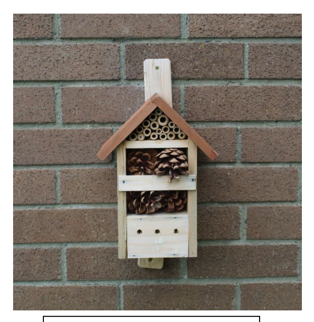
Figure 2.3 Bee hotel on campus

Wildflower monitoring can be carried out by BotSoc, incorporated into botany/ecology modules or covered through outreach events such as GoWild in Galway. Hedgerow management should be carried out according to <u>NBDC (2016g) guidelines</u>.