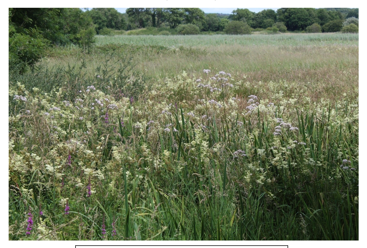
Figure 3.1 Wetland along the Biodiversity Trail on campus

Due to being on the banks of the River Corrib, NUI Galway has extensive wetland habitats (Figure 3.1), including reedbeds, marshes and wet grasslands. However, there are no ponds on campus- habitats that provide shelter and breeding grounds for a range of invertebrates and amphibians (Wood et al. , 2003; Gaston et al. 2005b). These actions will take a number of years to be implemented (Table 3.1).