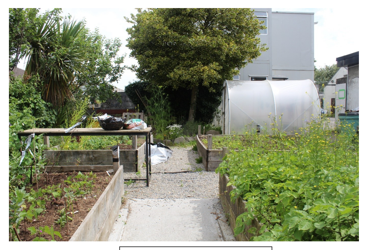
Figure 2.1 NUI Galway's organic garden

NUI Galway's Organic Gardening Society (Figure 2.1) is situated behind No. 12 Distillery Road, with the garden being open during term from 4-5pm on Tuesdays and 12-2pm on Saturdays. This society practises sustainable gardening. They grow a variety of crops, including tomatoes, apples, lettuce and potatoes, herbs, and borage for pollinators. It is open to all members of the college as well as the public. By raising awareness of this society, it will gain more support and develop the organic garden on campus to grow more produce, support pollinators, contribute to students' education and promote positive mental health.