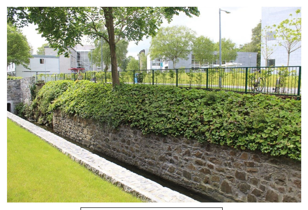
Figure 5.2 Monoculture of winter heliotrope

Actions (Table 5.1) including a literature search should be done annually to ensure the most up to date management practices for removal of invasive species on campus are adhered to. In addition, the campus should be used as a living lab for research into invasive species management techniques to determine whether the management regimes are working and to discover any new introductions. Planting of invasive species on campus should stop immediately in favour of native and non-invasive non-native species that promote an increase in biodiversity. Suggestions for alternative planting (Table 5.2) are supported by the National Biodiversity Data Centre's All Ireland Pollinator Project (NBDC, 2016g; 2016i) and other pollinator research (Balfour et al., 2013), with the invasive species' replacements fulfilling a similar aesthetic role. It should be noted that this is by no means an exhaustive list. This ties in with the NUI Galway Pollinator Plan 2018-2020.