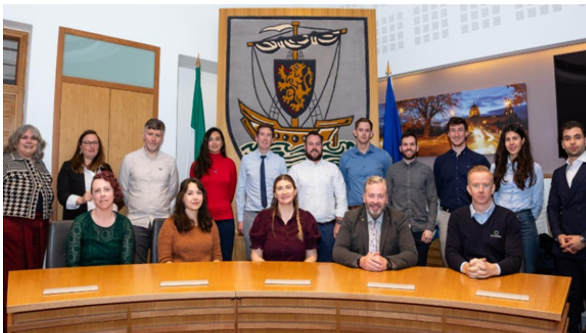
Members of the EU Urban Innovative Actions (EUI) Waterways Project partnership at the project's first meeting, hosted by Galway City Council