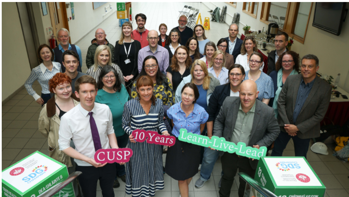
Celebrating 10 years of CUSP, Members of the Community University Sustainability Partnership.

This newsletter offers a snapshot of sustainability activity during Semester 1, Academic Year 2025–26, with a particular focus on initiatives supported through the Community University Sustainability Partnership (CUSP). It highlights selected examples of collaborative work led by the Sustainability Office and partners across the University and wider community, and invites staff, students and partners to join us as we learn, live and lead towards a more sustainable future.