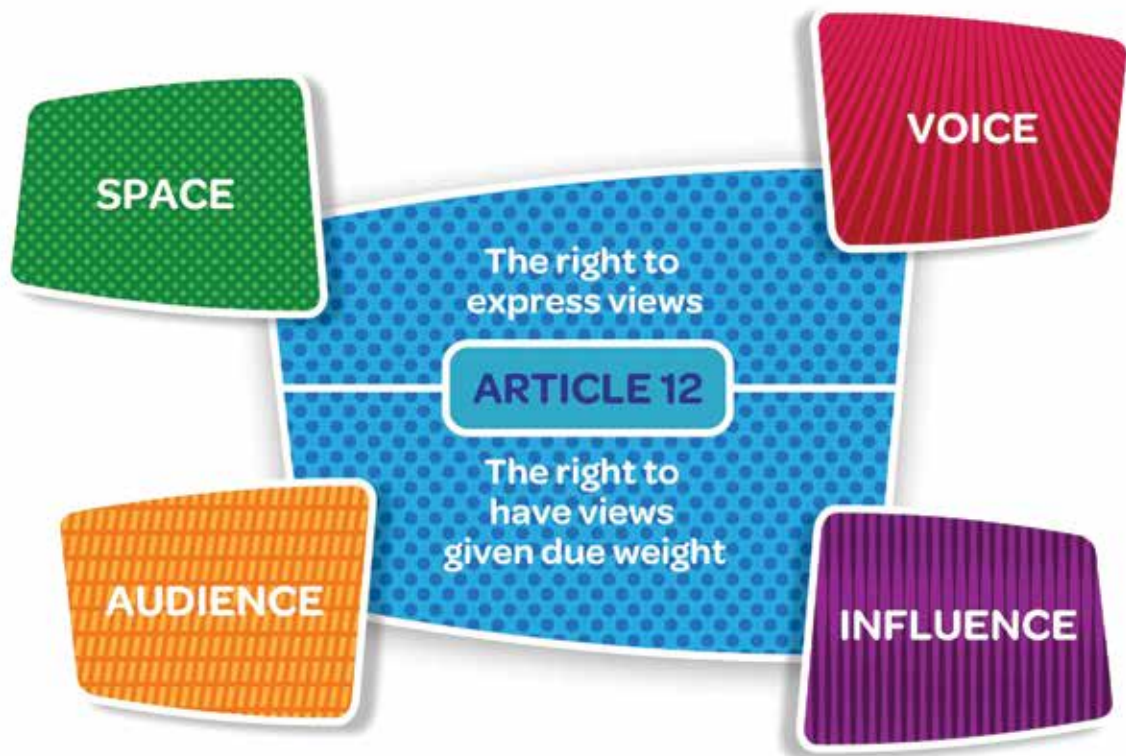
Figure 1: Lundy's Model of Participation (Lundy, 2007)

This model provides a way of conceptualising Article 12 of the UNCRC which is intended to focus educational decision-makers on the distinct, albeit interrelated, elements of the provision. The four elements have a rational chronological order: