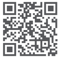
Download International Application Form