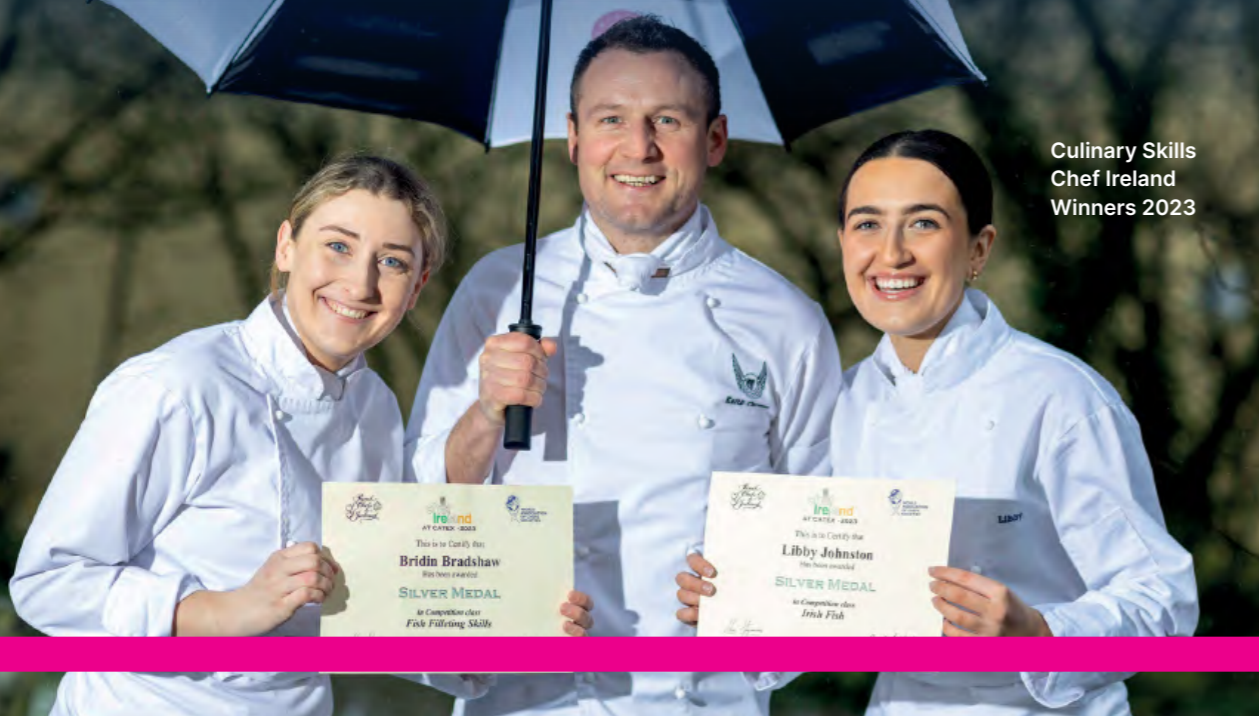
Culinary Skills Chef Ireland Winners 2023

The Bachelor of Commerce (BComm) prepares students for a career in business management in the hotel industry and also provides an opportunity to specialise in a business discipline in the final academic year.